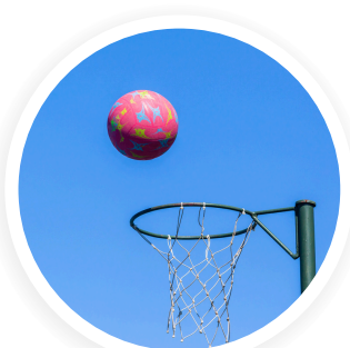
Play time: min 5 games/team