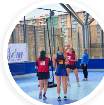
Ladies Netball Tournament