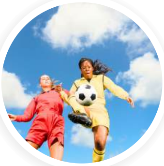
5-a-side Football Tournament