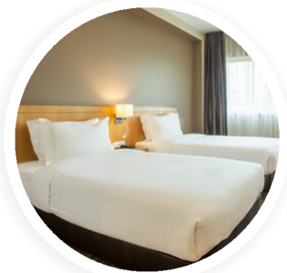
City Centre Hotel