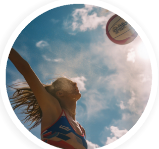
Play time: min 5 games/team