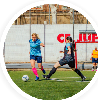
Football Tournament 7-a-side