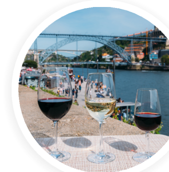
Port Wine Tasting + Cruise Experience