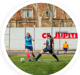
Play time: min 5 games/team