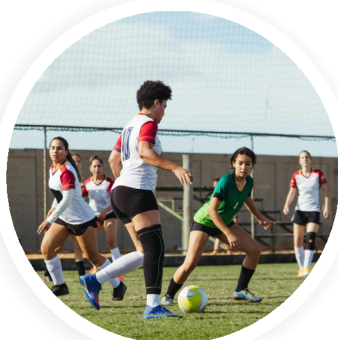
Football Tournament 5-a-side